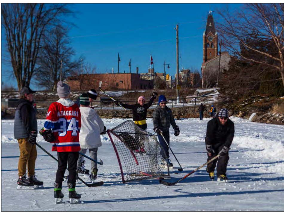
A hockey game is pictured at Victoria Park as temperatures dropped Saturday. A number of skating rinks are set up each winter in the inner harbour.