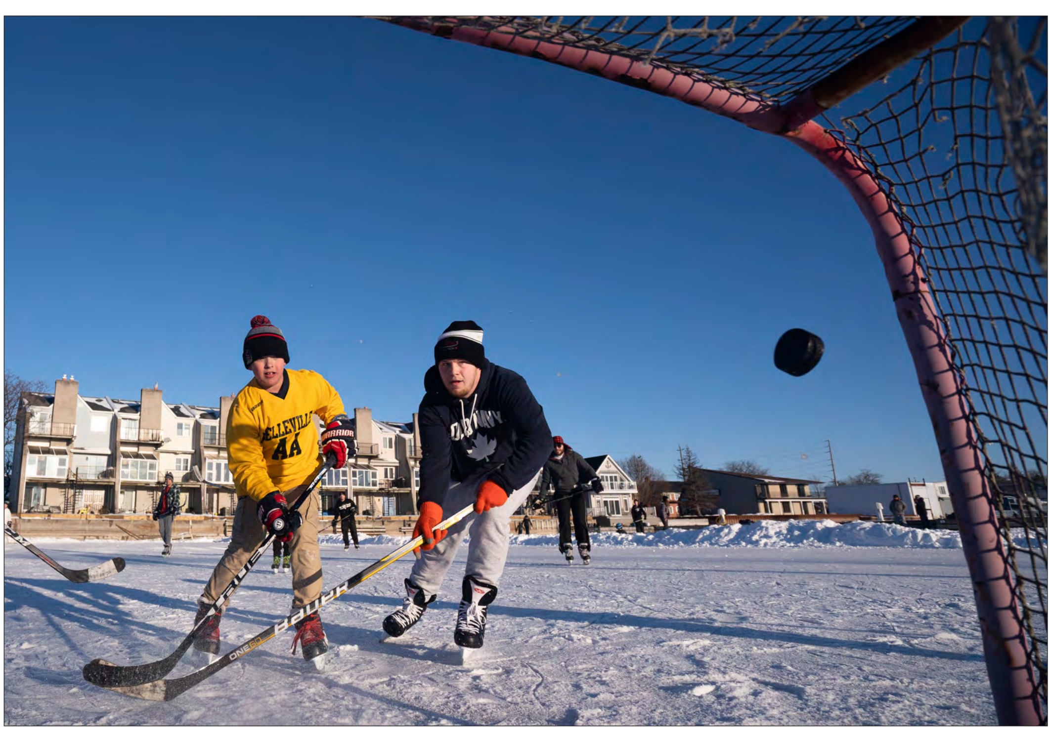
He shoots, he scores!

Loyalist College · Belleville, ON · Canada