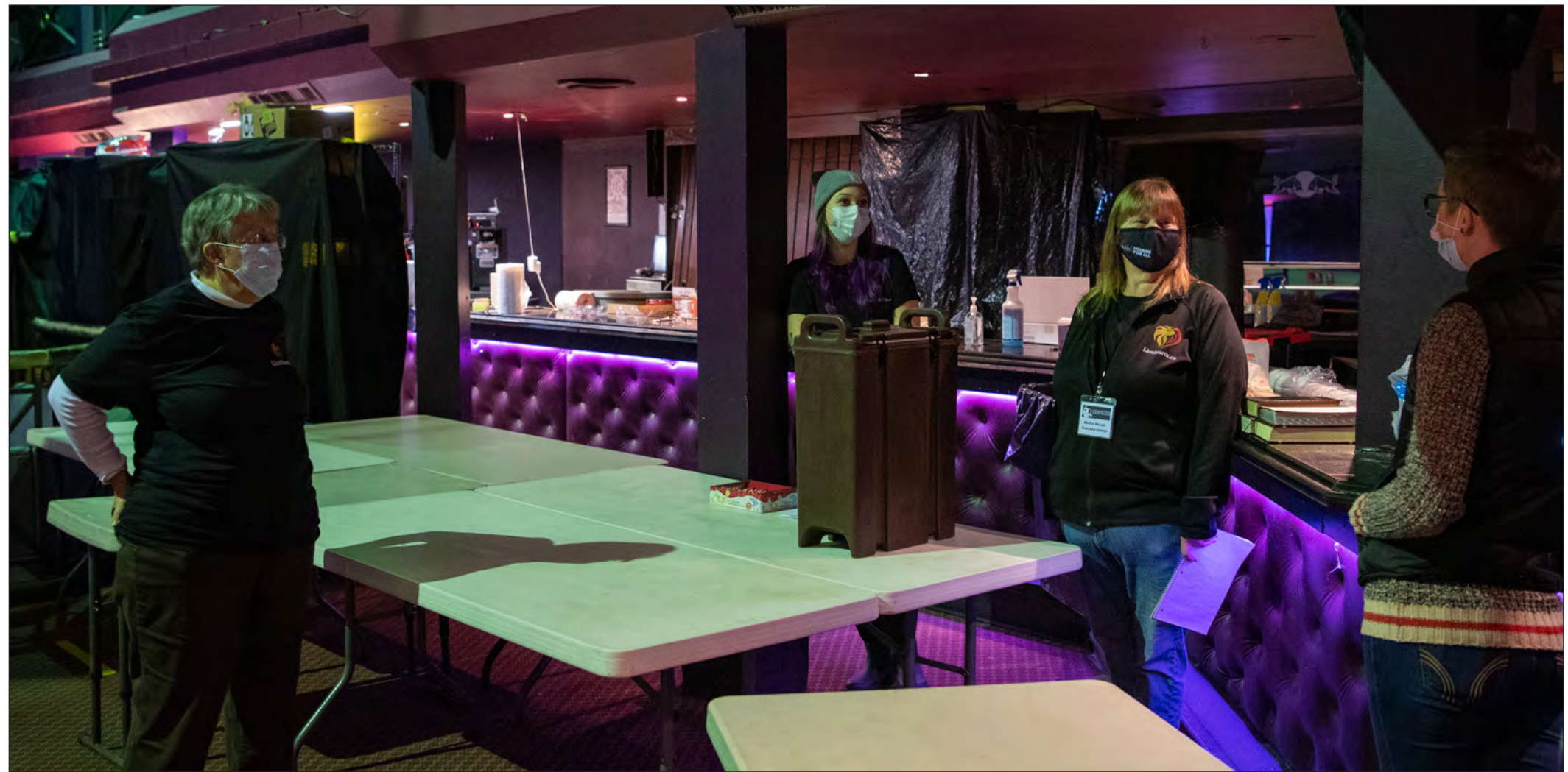
Lionhearts volunteers at the warming centre at Stages in Kingston get ready to welcome members of the community.