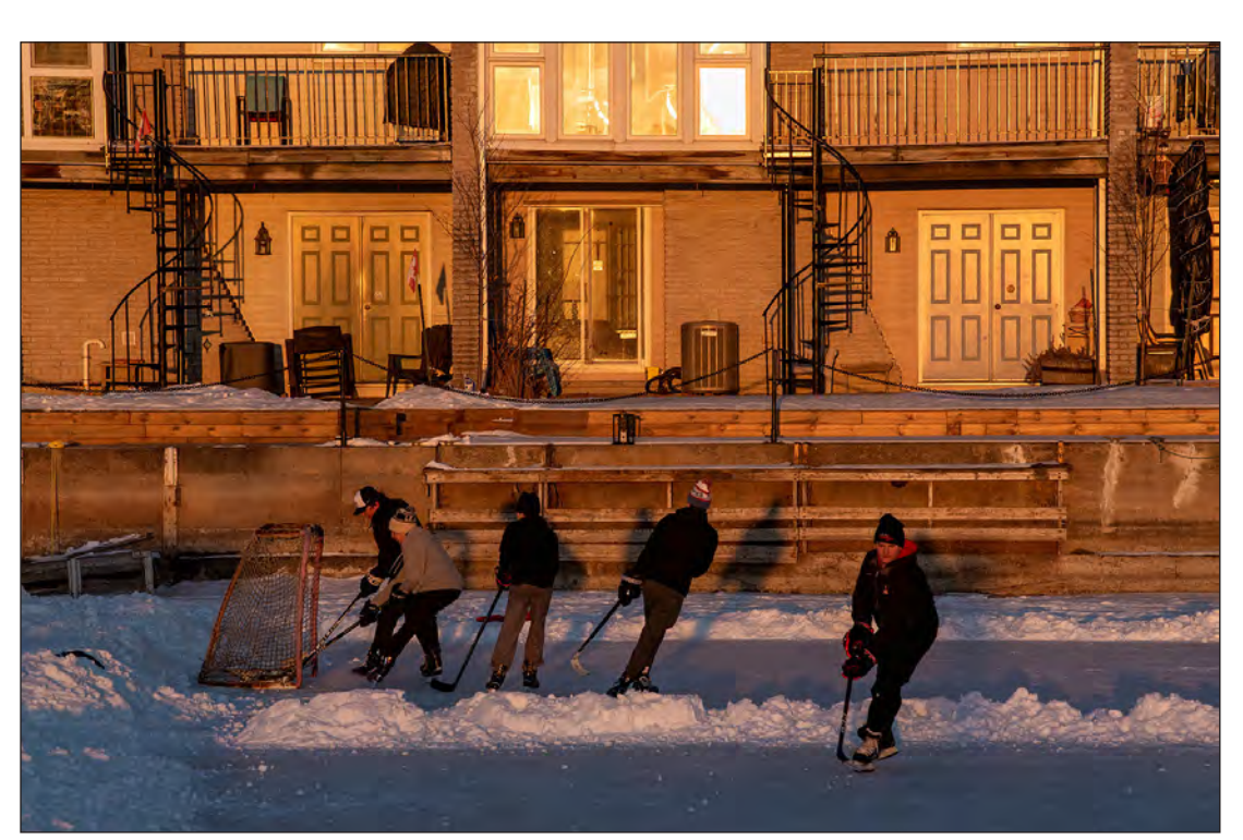
People play hockey on the frozen Victoria Harbour near the Bay of Quinte Yacht Club.

This outdoor ice rink has shown how much a community can come together for something that everyone can enjoy.