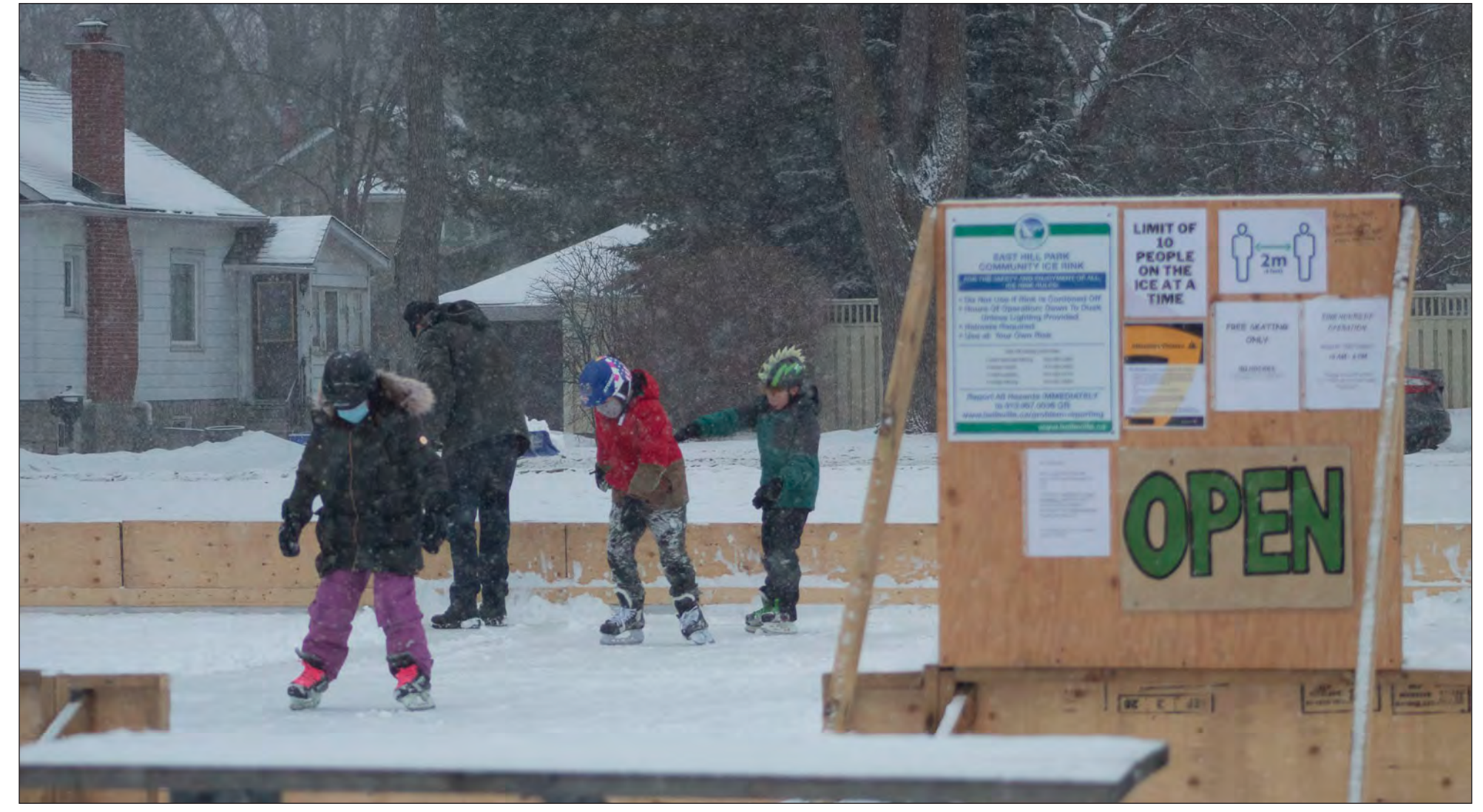
Kids around East Hill park are enjoying the ice put in place in early January to be able to skate as an after-school, outdoor activity. Parents and other members of the community are also taking advantage of the community-made ice rink.