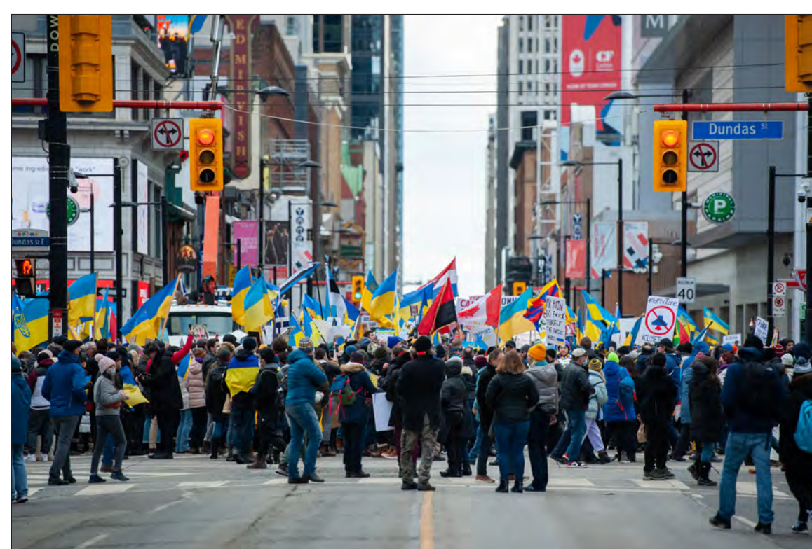
(Left) TORONTO, ON. - Upwards of 20,000 people gathered to march from Yonge and Dundas Square to Nathan Phillips Square to call for a stop to Russia's invasion of Ukraine.