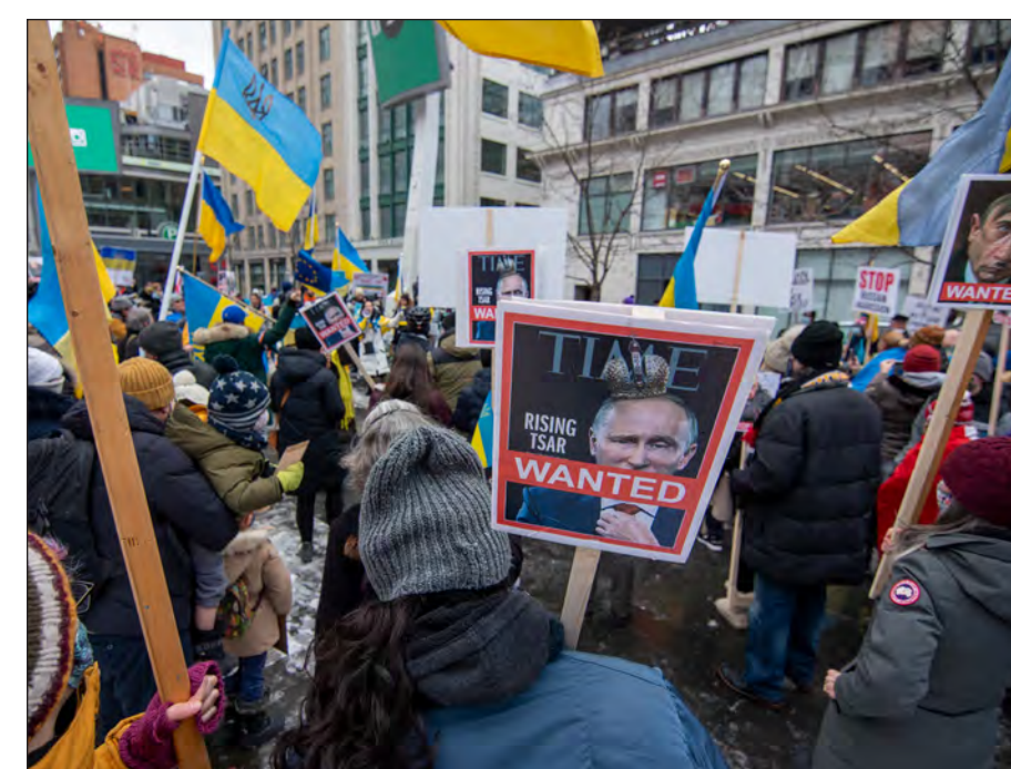
(Above) TORONTO, ON. - A demonstrator holds a sign of an altered Time magazine cover of Russian President Vladimir Putin. Thousands gathered at Yonge and Dundas Square to march in solidarity with Ukraine.