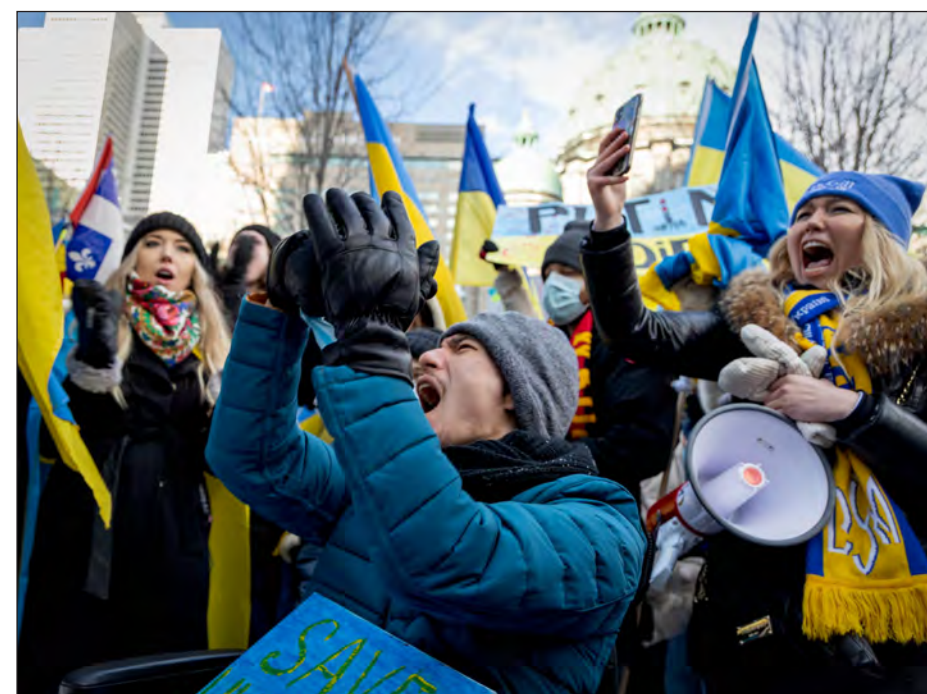
(Right) MONTREAL, QC. - Protesters chant "slava Ukraini" (Glory to Ukraine) on Feb. 27. Hundreds of people gathered in Montreal's city centre to denounce Russia's war.