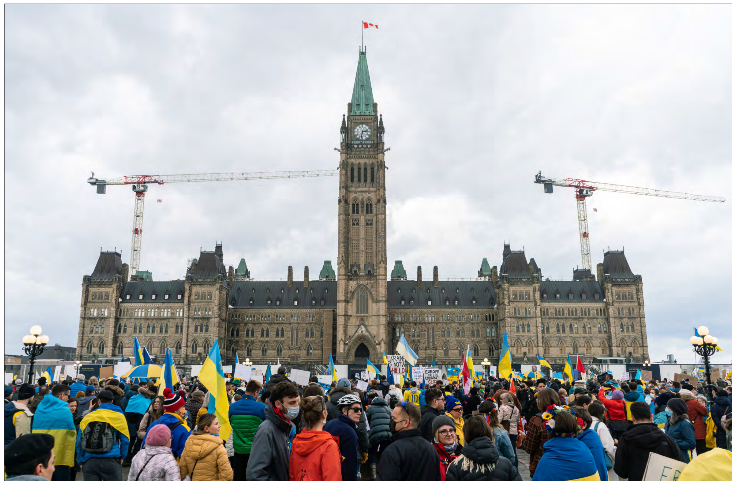
OTTAWA, ON. - A large crowd gathers on Parliament Hill on March 7, during the "Stand with Ukraine" rally. Thousands of supporters shared prayers, chants and messages of love towards Ukraine.