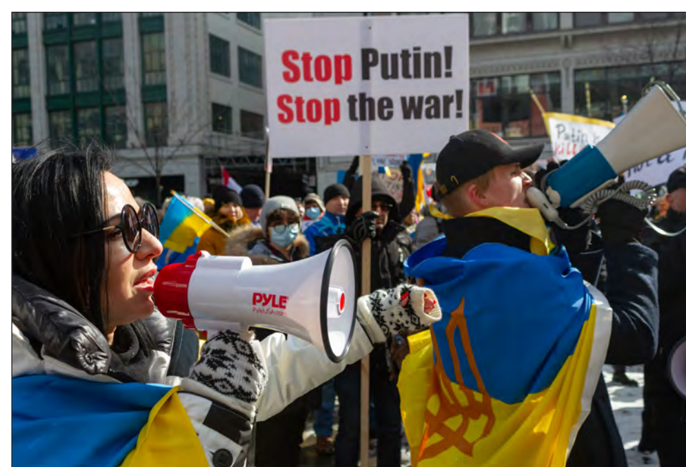
(Right) MONTREAL, QC. - People stand in solidarity with Ukrainians in Montreal, Quebec on Feb. 27. Several protesters gathered outside the Russian consulate to rally against the invasion of Ukraine.