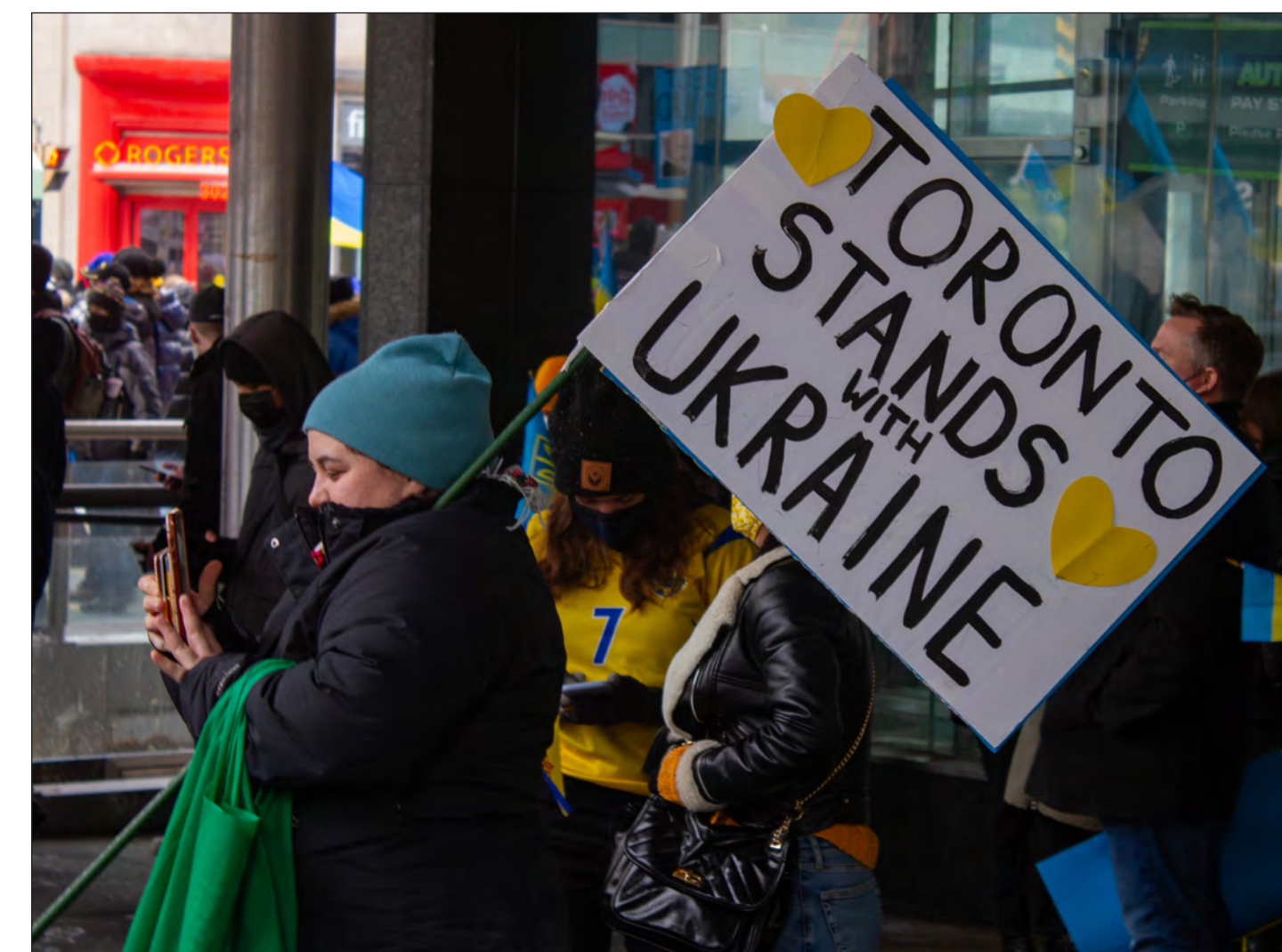
(TORONTO, ON.) - A woman stands among a throng of demonstrators in Yonge and Dundas Square holding a sign in support of Ukraine.

situation to help in any way we can until everyone is in safety." For the past two weeks, major cities around the world have seen rallies of thousands in their streets as a support of Ukraine and protesting the actions of the Russian government. Millions worldwide have taken the initiative to help Ukrainians in any way imaginable. Some individuals are even booking Airbnb lodging they won't end up staying in to directly support Ukrainians under siege by Russian forces.